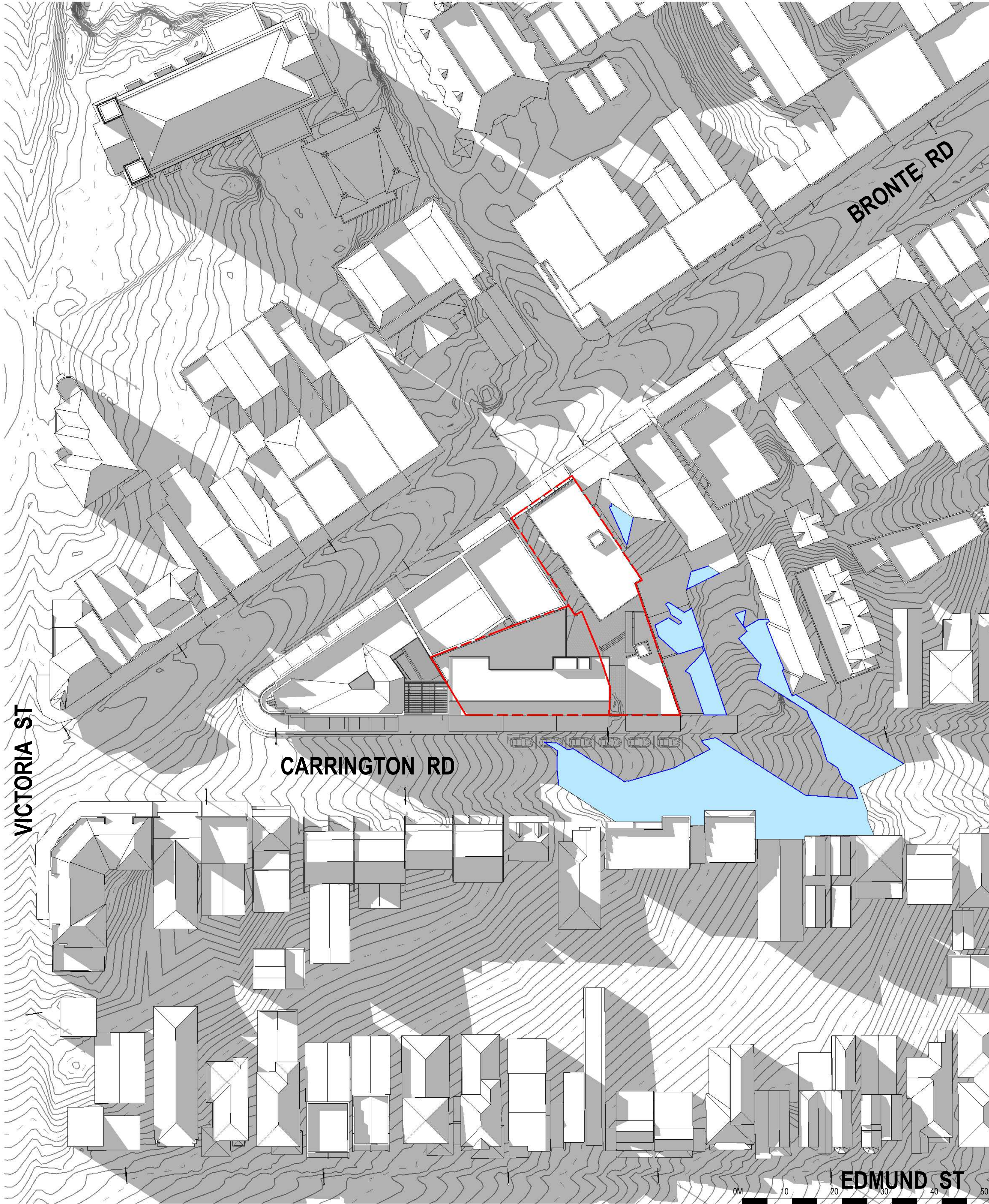
2 Shadow Plan - Proposed - Winter Solstice 9:00AM 1 : 500

Suite 35, Level 2, 94 Oxford Street Darlinghurst NSW 2010 Australia +612 9367 2288 hello@h-e.com.au www.h-e.com.au PO Box 490 Darlinghurst NSW 1300 Humphrey & Edwards Pty Ltd | ABN 88056638227 Nominated Architect: Glenn Cunningham #6415