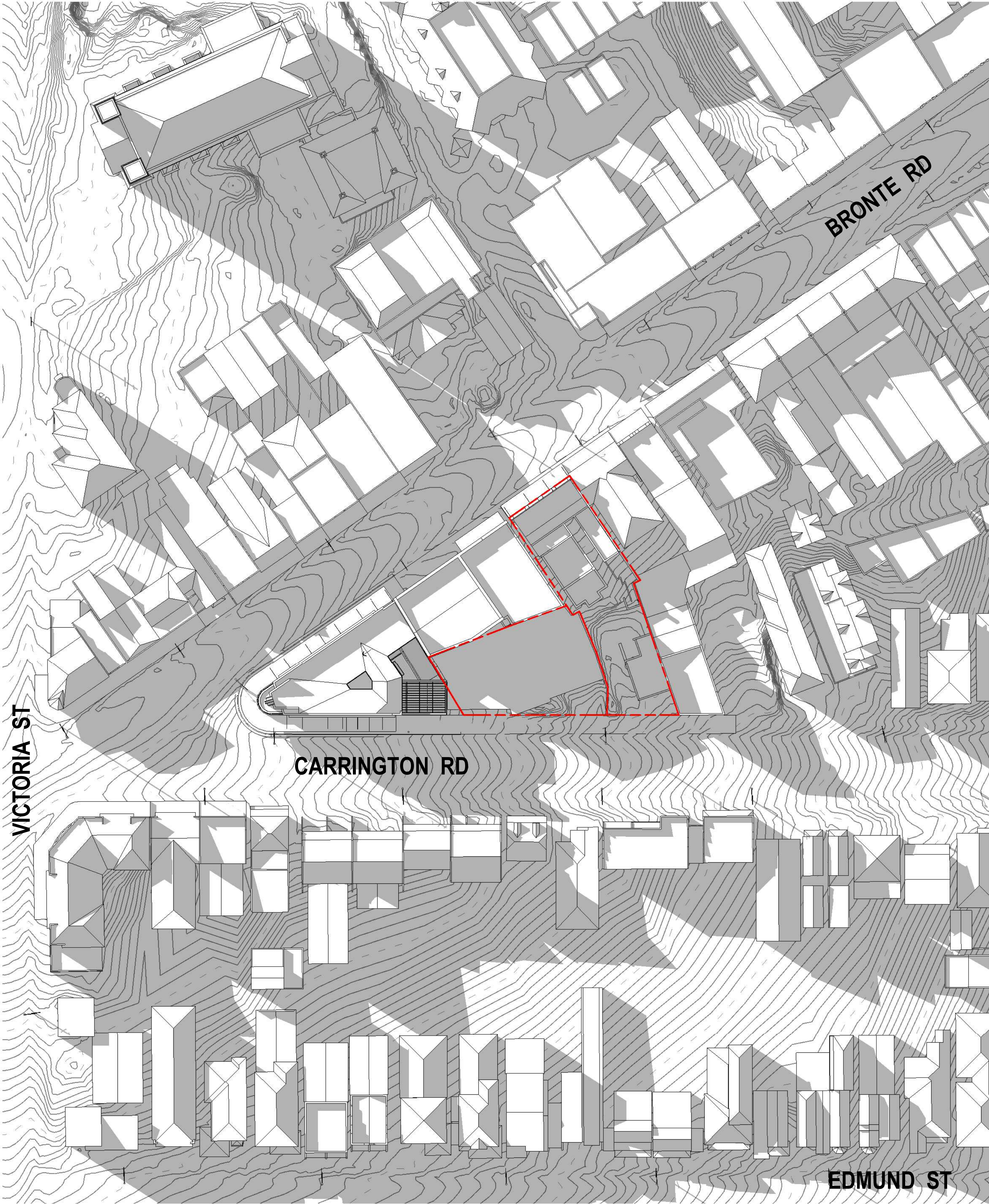
1 Shadow Plan - Existing - Winter Solstice 9:00AM 1 : 500

General Notes The copyright of this design remains the property of H&E Architects. This design is not to be used, copied or reproduced without the authority of H&E Architects. Do not scale from drawings. Confirm dimensions on site prior to the commencement of works. Where a discrepancy arises seek direction prior to proceeding with the works. This drawing is only to be used by the stated Client in the stated location for the purpose it was created. Do not use this drawing for construction unless designated.